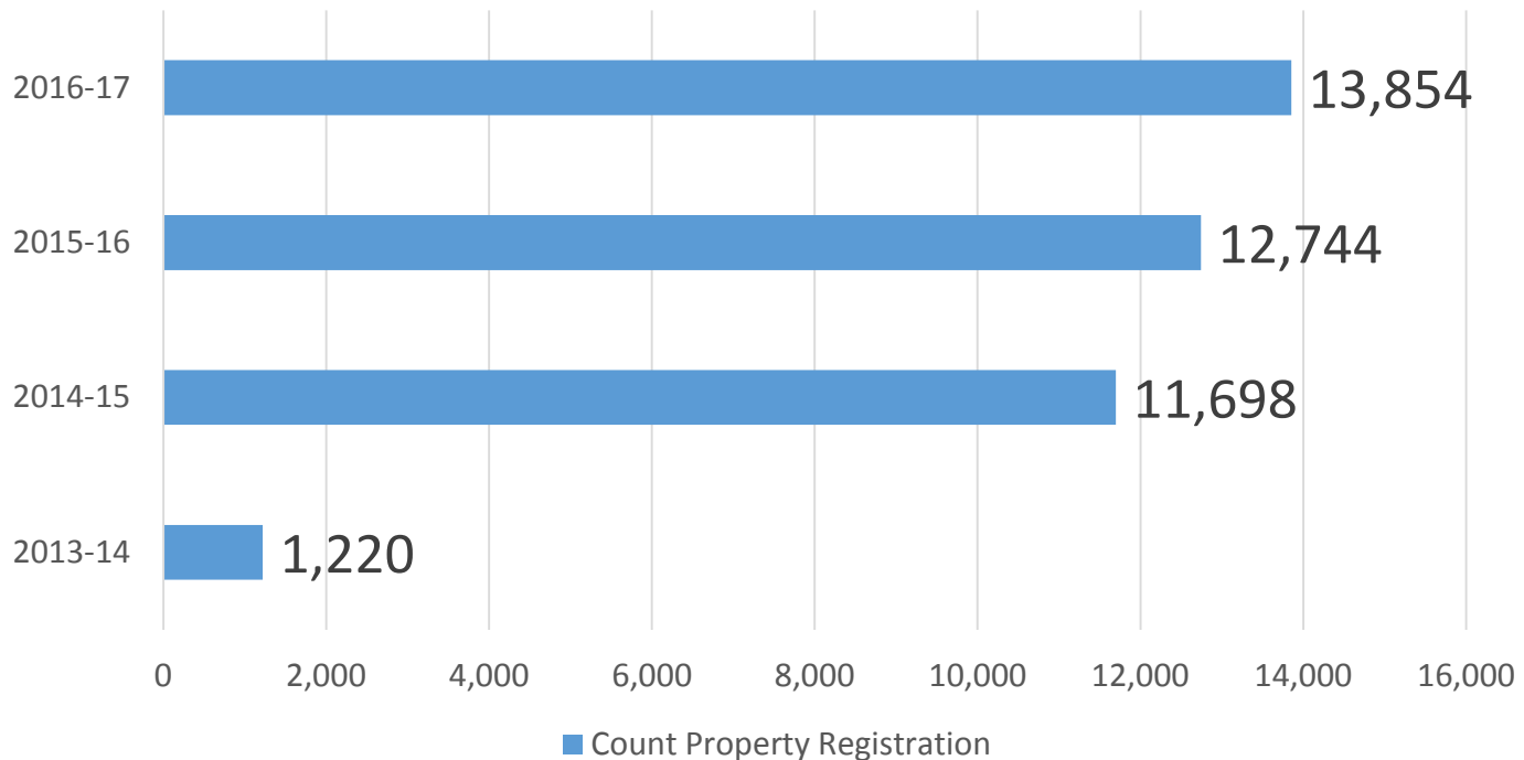
Property Registration by Year